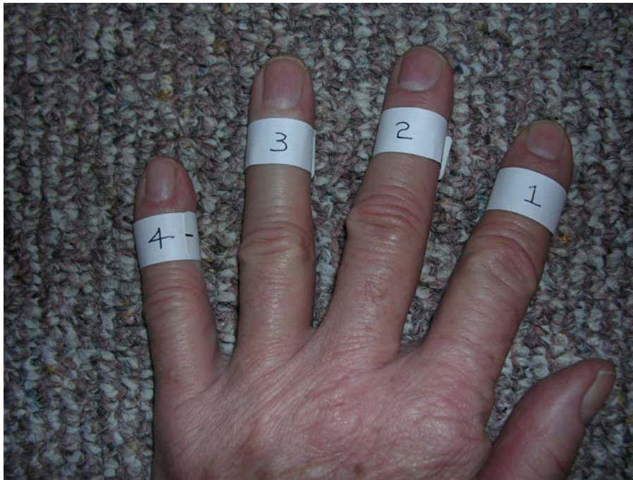
Figure 7. Numbering of the fingers

The fingers are numbered as shown in Figure 7. This may help the student in locating the chords in Figure 6.