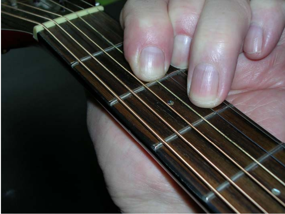
Figure 8. “D” Chord

Shown in Figure 8, Figure 9, and Figure 10 are the three chords to practice over and over until the procedure becomes automatic. It may be helpful to note that the fingers are placed above the second and third frets for all three chords.